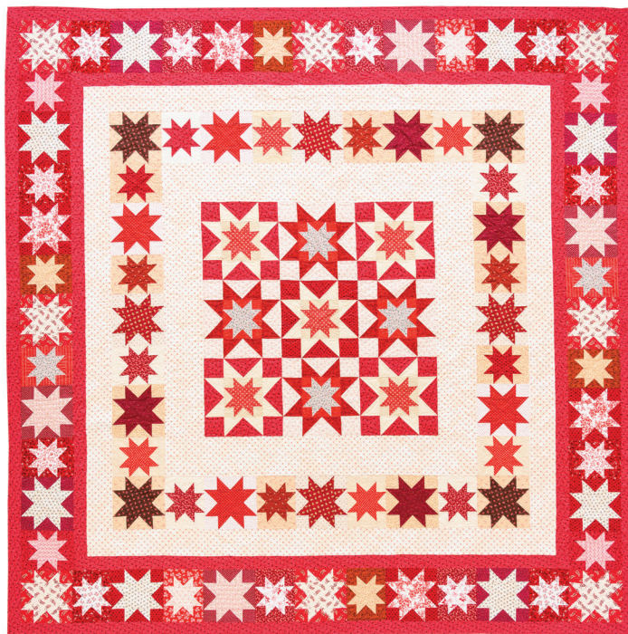
Red and White Version from Page 27